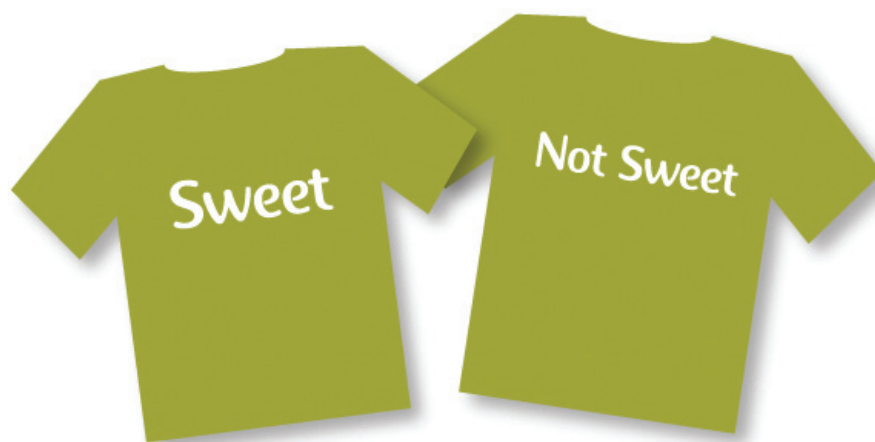
Back of T-Shirt (your choice)