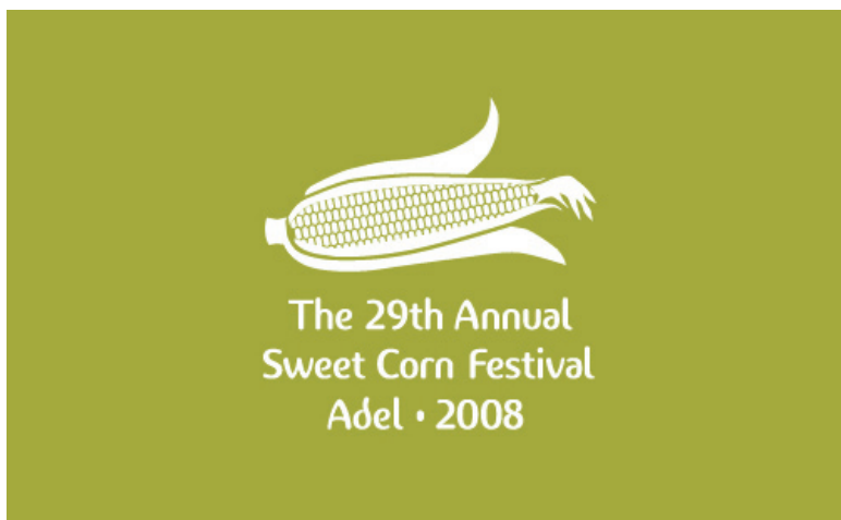
Front of T-Shirt, left pocket area

Raccoon Valley Wine Festival 2008 commemorative glasses ($5 each) will also be for sale at the Adel Partners booth.